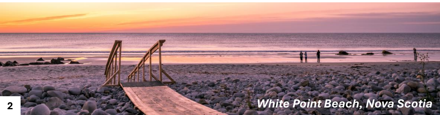
White Point Beach, Nova Scotia

Information and pictures of accommodations and facilities can be found at www.whitepoint.com . See the Property Map on page 7 of this guide for more information.